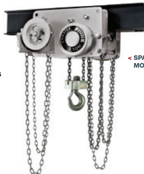
◀ SPARK-RESISTANT MODEL

Available for use on inclined monorails or for shipboard use to provide increased control over the trolley to prevent unintended movement.