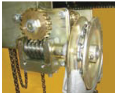
▲ RACK & PINION TROLLEY DRIVE

Available for use on inclined monorails or for shipboard use to provide increased control over the trolley to prevent unintended movement.