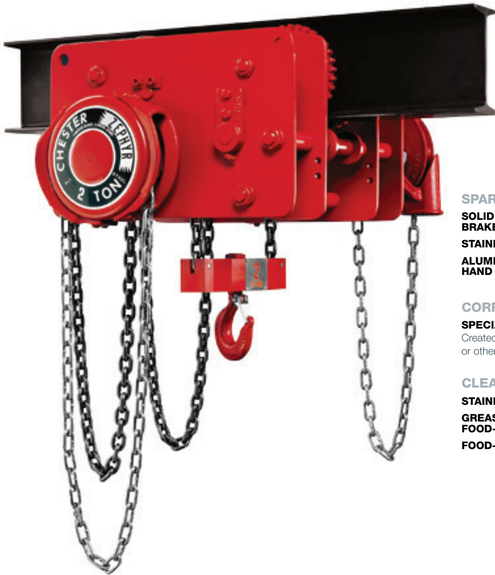
◀ STANDARD MODEL